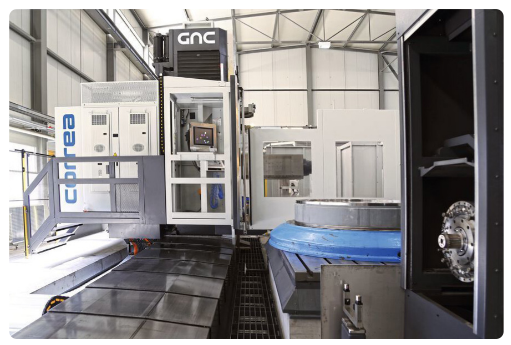
Hydro's milling machine AXIA is equiped with automatic head changer for two heads.

The machine allows machining in up to 6 axes thank to its turning plate and the B and C axis integrated in the head. Considering the parts size, small batches and variety of components; flexibility, precision and process reliability are important. Moreover, it has been decisive the machine rigidity as we work with material which are difficult to machine."